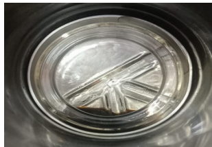
SWIFTPOWER 7 \pi 10W-30 SP/MA2